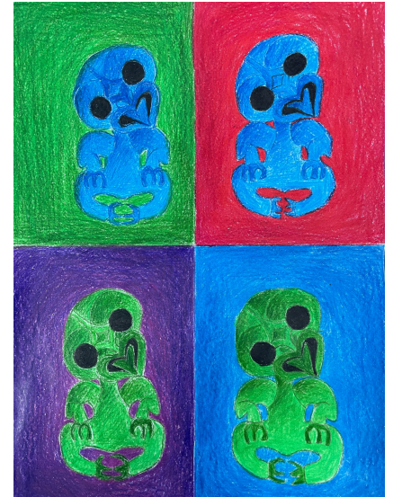
Tiki by Te Waipounamu