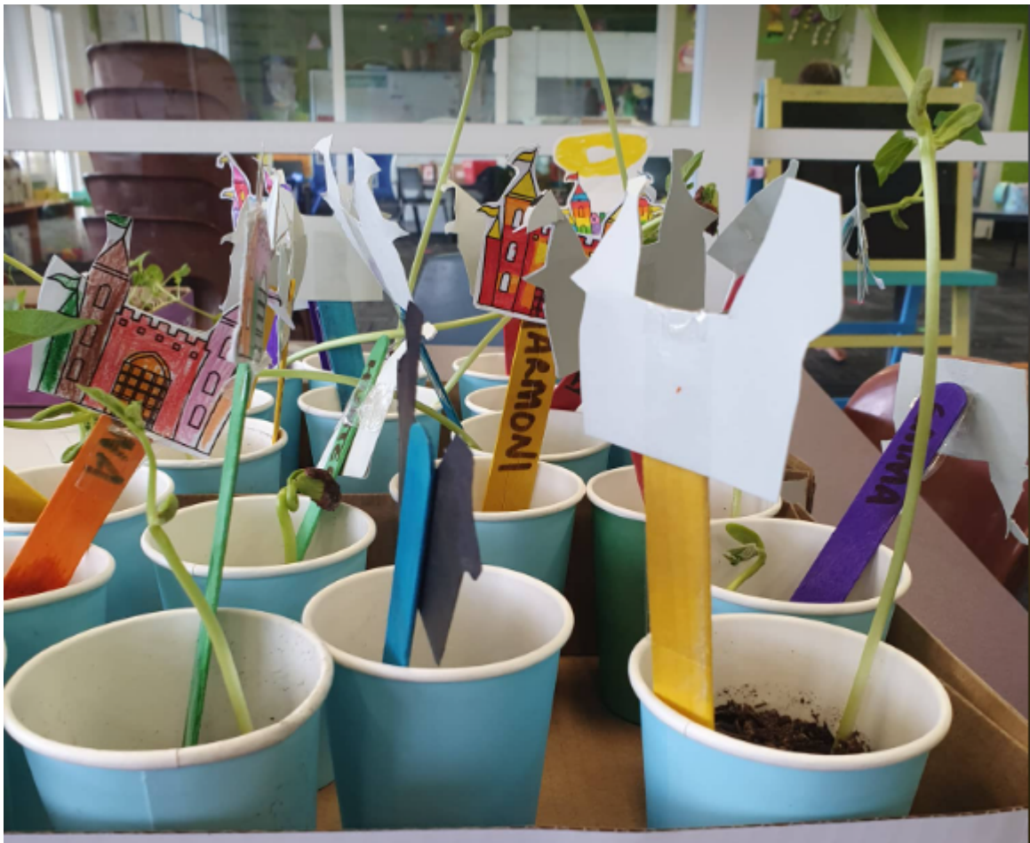
We made castles for our Bean Stalks to race up to... some have already met their target. For mathematics, we measured the height. Some were as tall as 29 cm high, some are trying to grow their first leaves.