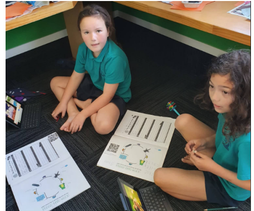
Room 3 worked hard to work cooperatively on their Life-Cycle mahi.